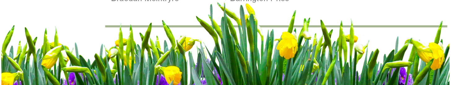
Daffodil flowers begin to pop up when winter ends. They're a symbol of spring and symbolize new beginnings and rebirth